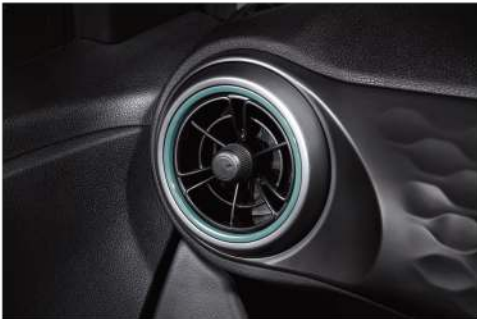
Unique propeller-style AC vents