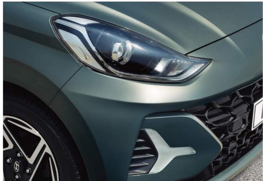
Projection headlamps / LED Daytime Running Lights (DRL)