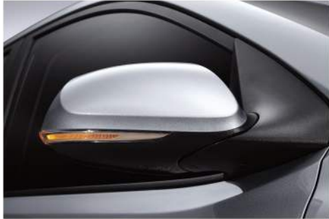
Outside mirrors & repeaters