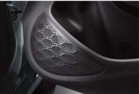
Front / Rear four-speaker system