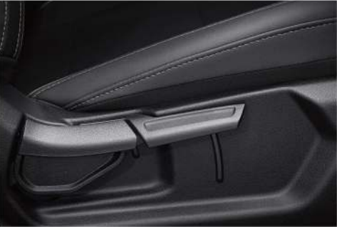
Driver seat height adjuster