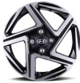
15" Alloy wheel