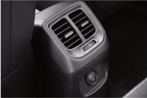
Rear AC vents