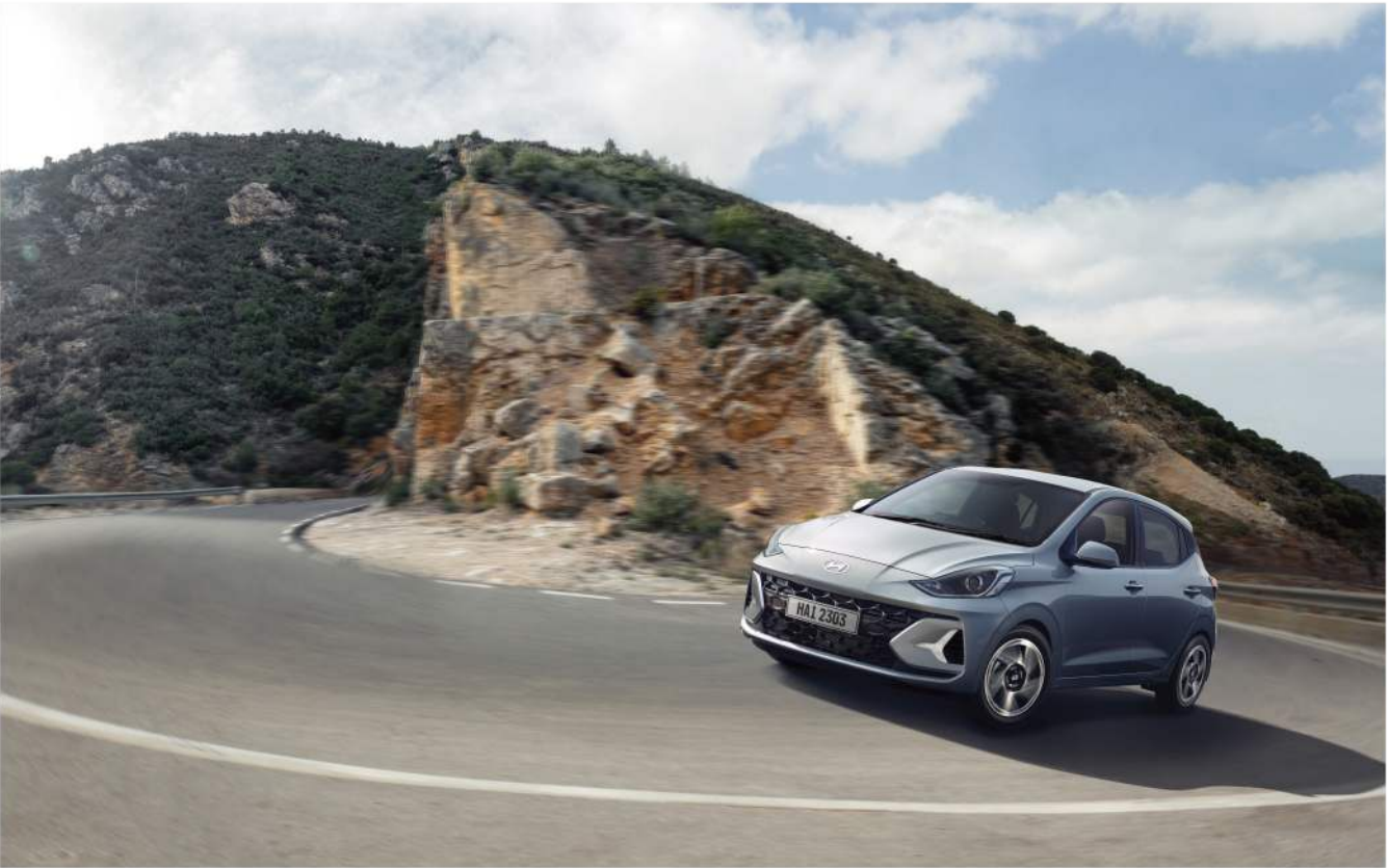
Anti-lock Brake System / Electronic Stability Control By pulsing the brakes up to a dozen times per second, ABS prevents the wheels from locking up and skidding so you can retain full steering ability and directional control. ESC works with ABS using throttle and brake intervention to help prevent