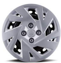
14" Steel wheel cover