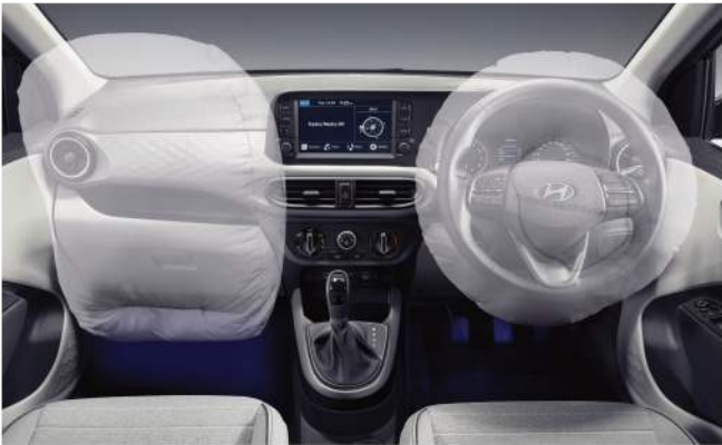
Dual airbag system Airbag deployment releases tremendous energy, but Grand i10's airbags are the newest depowered type, so they're gentler but just as effective in