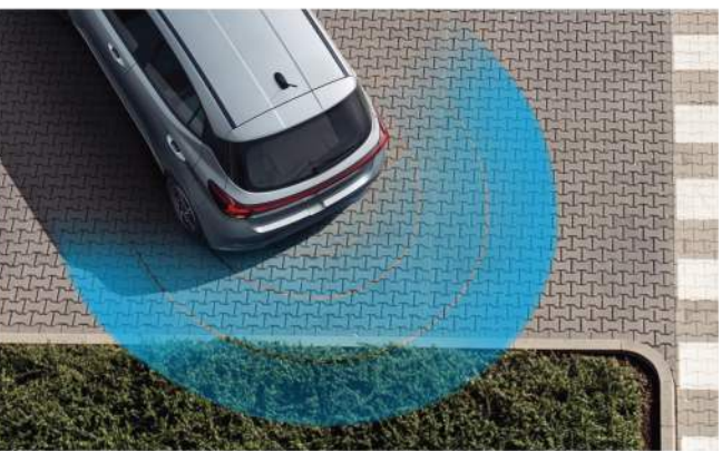
Hill-start Assist Control (HAC) Starting from a stop on a hill can be an anxious moment due to the fear of rolling back, but HAC ends driver anxiety by automatically holding the brakes Rear Parking Assist System When maneuvering into a parking spot, bumper-mounted sensors will provide you with greater peace of mind by alerting you with a series of beeps to let you know