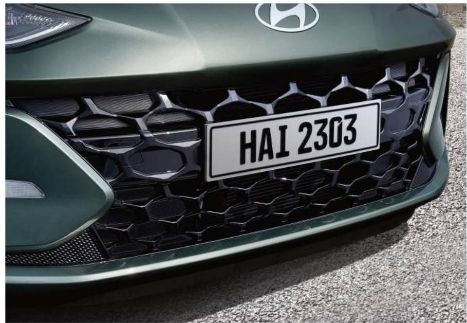
Glossy black radiator grille