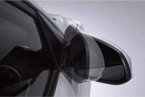
Electric folding mirrors