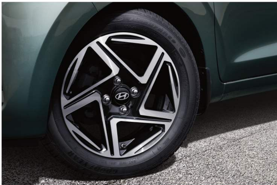
15" alloy wheels