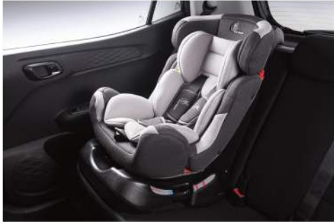
ISOFIX child seat anchor system