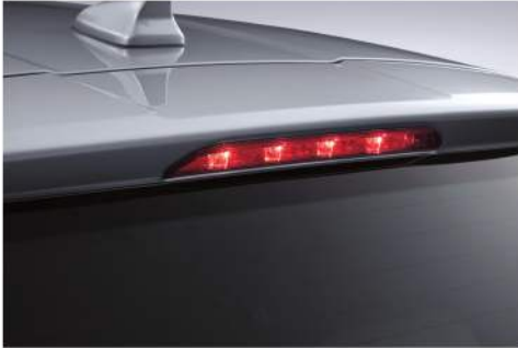
LED high-mounted stop lamp