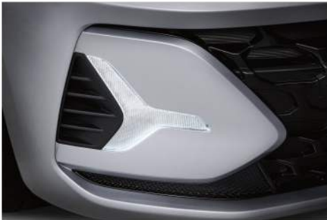
LED Daytime Running Lights (DRL)