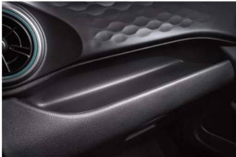
Practical storage area