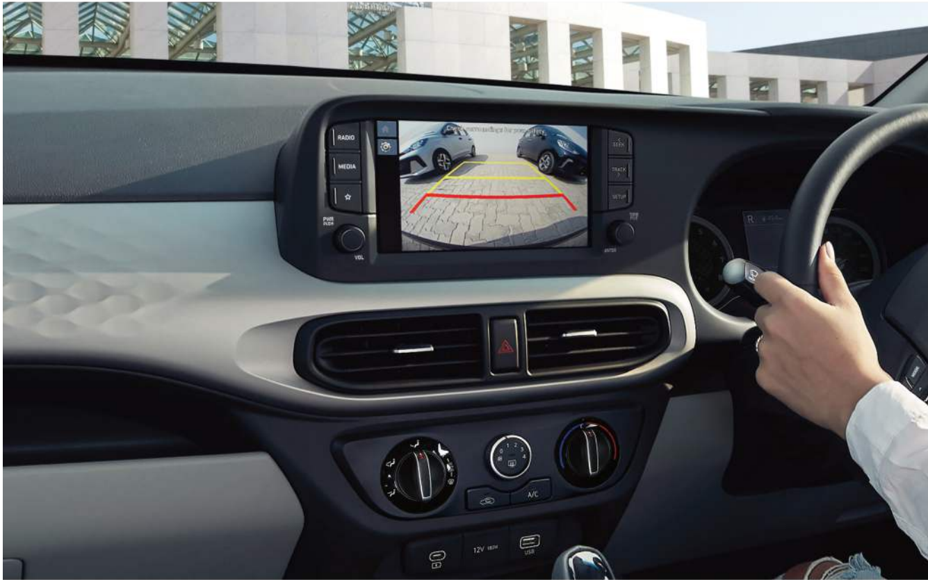
Rear view camera with guidelines When backing up, the dynamic guidelines help you avoid unintended bumps, nicks, and scratches and lower your stress level when parking.

Grand i10 keeps you safe with dual airbags that we hope you will never need. They are the depowered type that deploy much more gently to reduce the risk of injury. Anti-Locking Brakes are standard but are also available with Electronic Stability Control and Hill-start Assist Control as a bundled option. Other useful safety features like Tire Pressure Monitoring System and Parking Assist make your daily driving life much