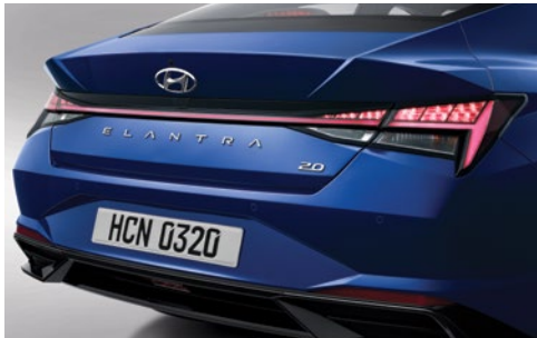
LED Rear Combination Lamp