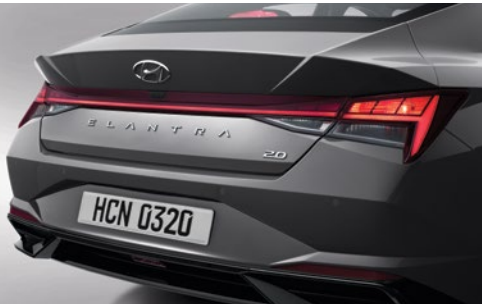
LED + Bulb Rear Combination Lamp