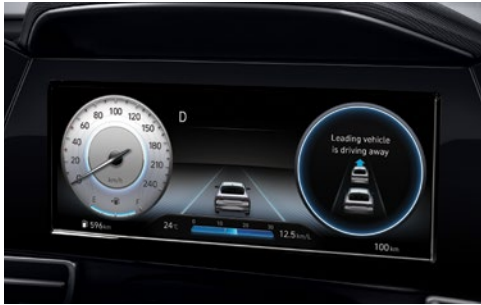
10.25" Full Color Cluster Display