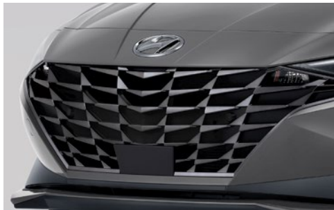
Chrome Radiator Grille