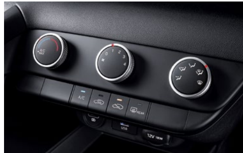
Manual Air Conditioner