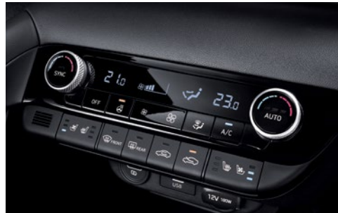
Dual Full Auto Air Conditioner