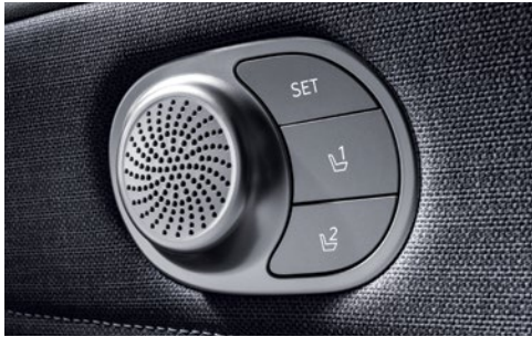
Memory System For Driver's Seat