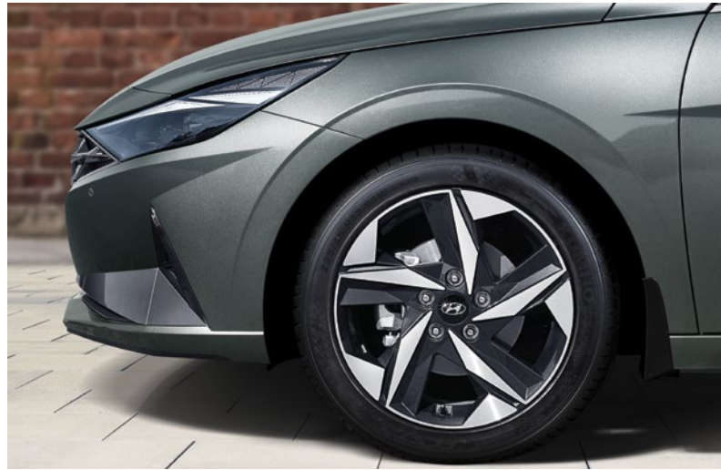
LED Headlights 17" Alloy Wheels & Tires