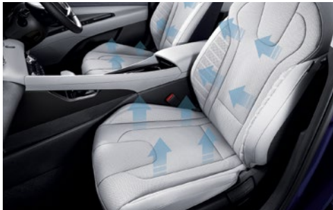
Ventilated Front Seats