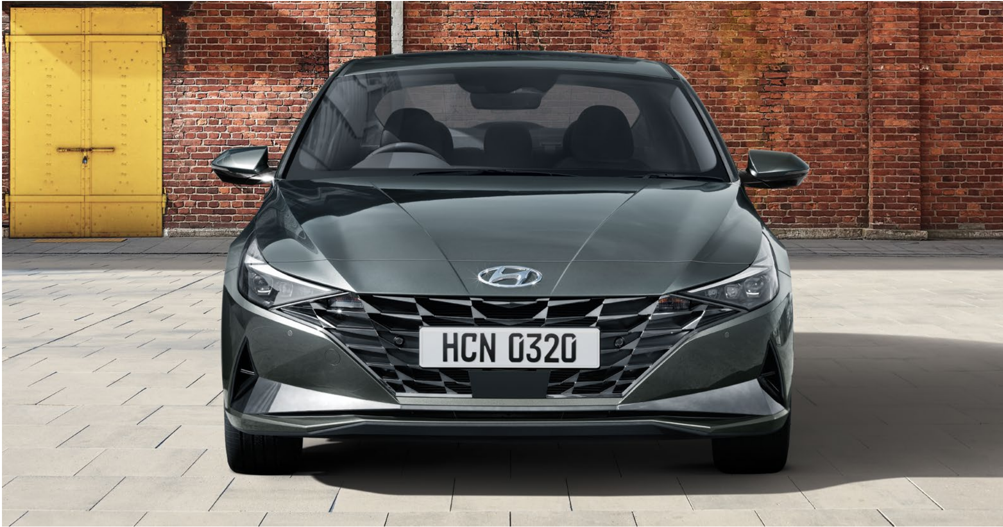
Parametric Jewel Pattern Grille

The stereoscopic Parametric Jewel-pattern design highlights the depth of the front grille, making it resemble diamond-cut gemstones, and the bold and elongated front headlights come together to give Elantra its front sporty look.