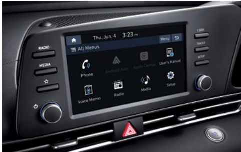
8" Display Audio System (matt, when selecting 4.2" color LCD cluster display)