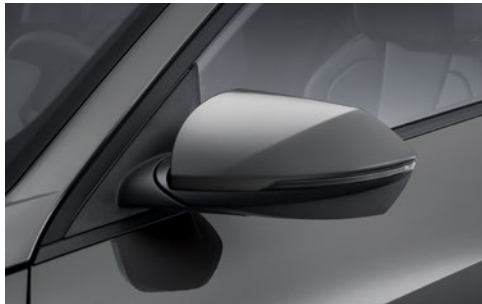
Exterior Sideview Mirrors (heated, power folding, LED turn signal indicators)